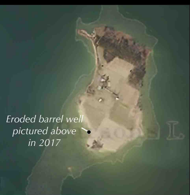
Eroded barrel well pictured above in 2017

In September 2013 erosion along the southwest shore of Parson's Island in the Chesapeake Bay revealed an early 19th century brick well (inset right). When built this well served a farm complex and was far inland (inset left). By the Spring of 2014, shoreline erosion had left the well standing free from the bank, and by June it had collapsed. The staves of the barrel that formed the base of this historic well are visible in the surf in the larger image, some 10 meters from the eroding bank.